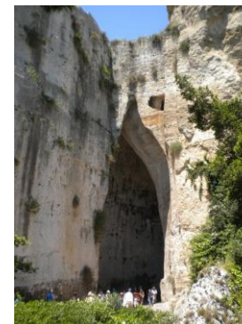
Dionysos's Ear –Siracusa–