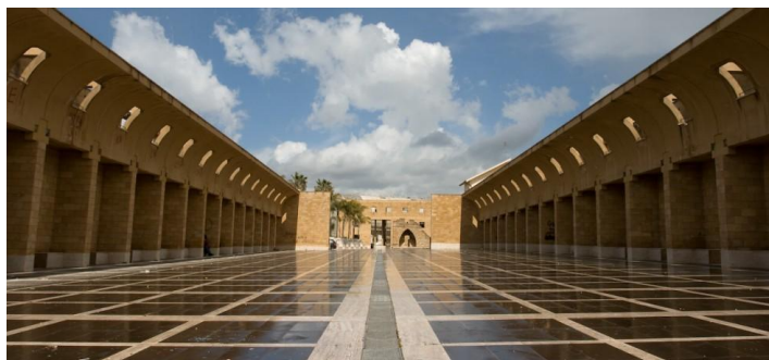
Squares System –New Gibellina-