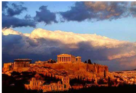
Temples Valley –Agrigento–