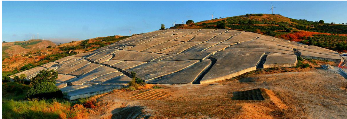
Alberto Burri's Cretto –Old Gibellina-