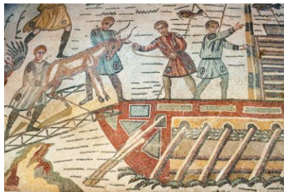
Casale Roman Villa -Piazza Armerina's mosaics