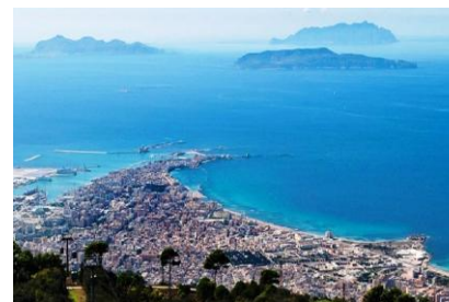
Trapani and the Egadi Archipelago