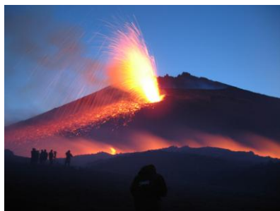
Etna Volcano –Catania-