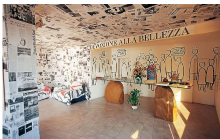
Hotel Atelier sul mare –Castel di Tusa-