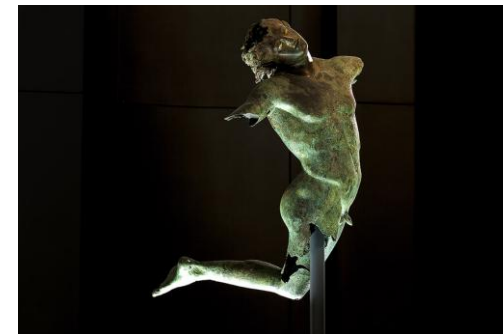
Dancing Satyr –Marsala-